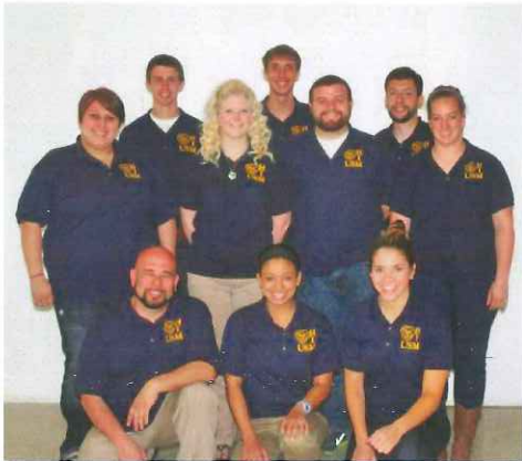
Health Information Management Professionals

Take medical skill and knowledge, add Information Technology, and Management Skill = Health Information Management Professional.